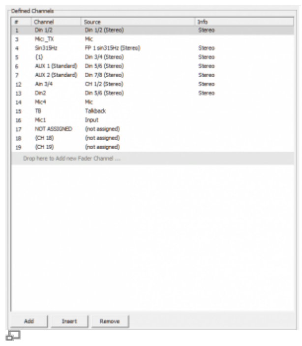
Fader Channels - Defined Channels area

In the Defined Channels area, you can create new fader channels and modify the existing ones. The list shows the defined channels. In the Nr (#) column, you see the serial number of the fader channel. The name of the channel is shown in the Channel column. The shown number of a channel is for information only, it has no meaning for the configuration.